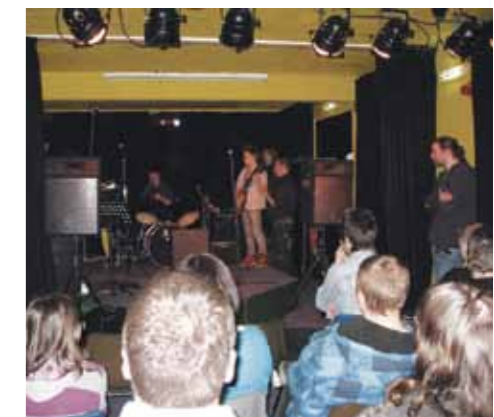
Live performance at Rosemount Community Centre for family and friends.

The music workshops held for the GKAC groups in Aberdeen in April were a great success. Ten young people attended, with six being involved in a performance for friends and family on the final day. The whole process of working and performing together was hailed a great success and will be repeated at the end of each term.